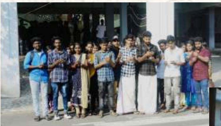
Students of Sree Ayyappa College on 14 th February, 2019 paid tributes to the forty CRPF soldiers by taking out candle march procession outside the campus.