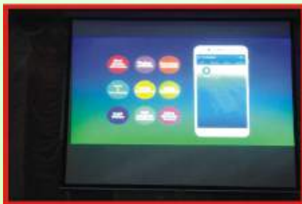
Video screening of KSITM mKeralam mobile app