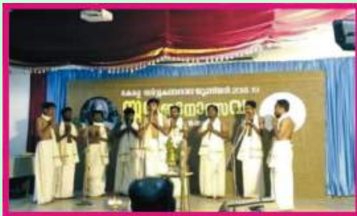
Our students received First place in “Vanjipattu”.

The students of Sree Ayyappa College has participated in various inter-college competitions during the “Kalolsavam 2019”, University Youth Festival held at University of Kerala, Thiruvananthapuram from 26-30 th March, 2019.