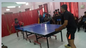
The Inter-college table tennis match held in college campus on 16 th November, 2019

The College Football, Cricket teams during the academic year 2019-2020 participated in several tournaments along with different colleges under University of Kerala.