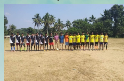
The Sports Day of Sree Ayyappa College was held on 03 rd March, 2020.