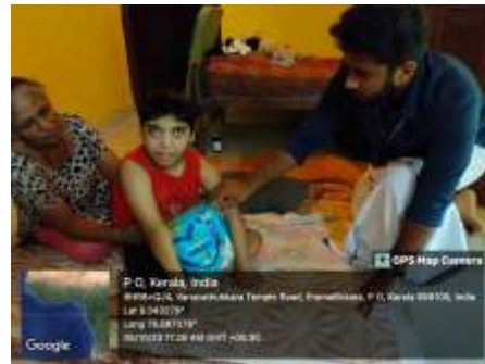
Distribution of diapers