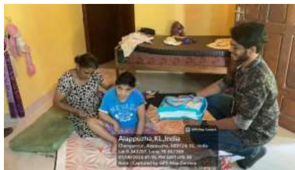
Distribution of diaper to a kid under palliative Care