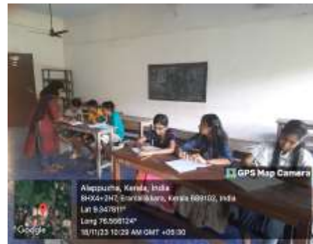
NSS PO taking classes to the children from the panchayath