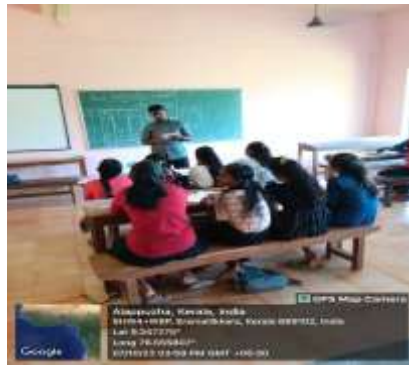
Volunteers taking Spoken English classes to the kids from the adopted village