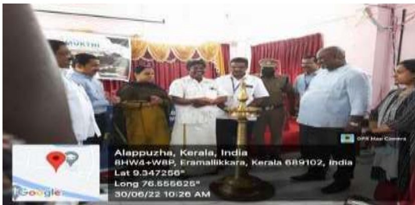
Inaugural session of Vimukthi Club on 31-06-2022