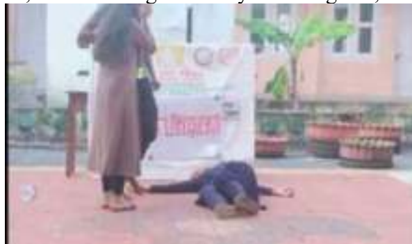
Students performing anti-drug awareness skit at S.N College, Ala