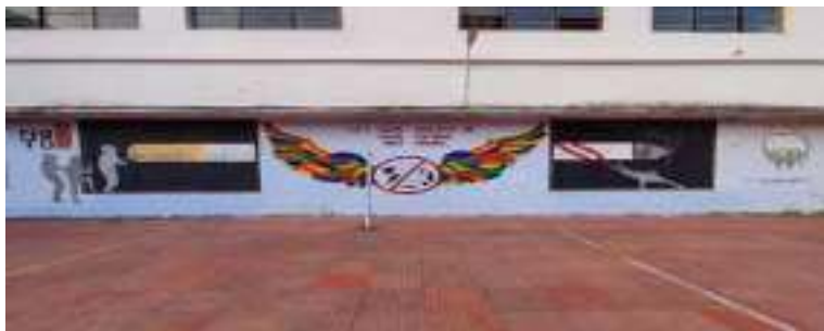
Anti- Drug Wall in the College