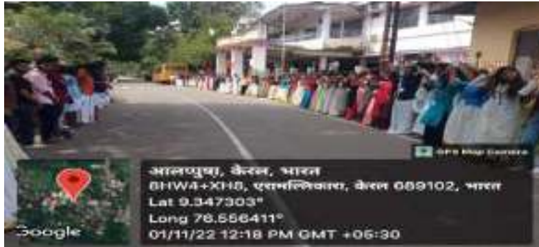
Human chain in front of the campus on November 1, 2020

https://www.youtube.com/watch?v=-fOQLWor2Wc