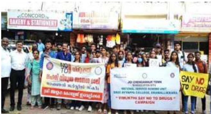
The team behind rally and flash mob