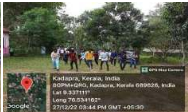
Flashmob at a school in Kadapra