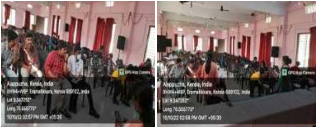
NSS Program Officers conducting Bodhyam Quiz