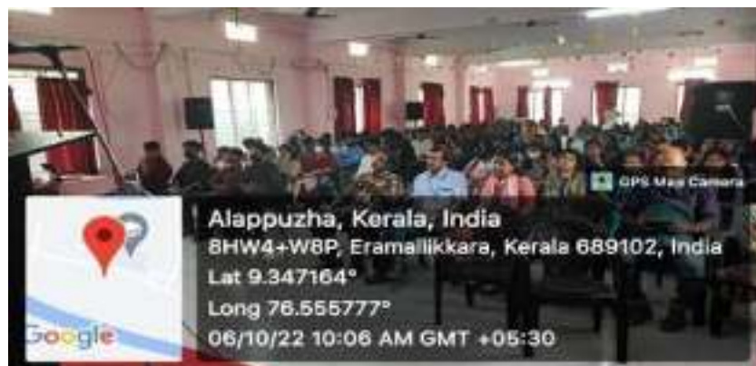
Audience listening to Chief Minister Sri. Pinarayi Vijayan's address to the student community of Kerala