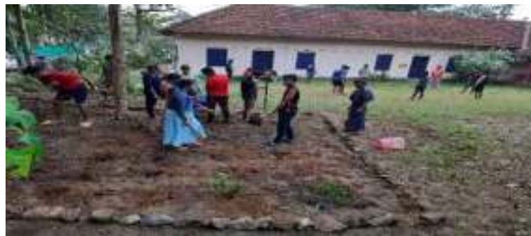
Students making garden

Students were engaged in a lot of recreational and productive activities to divert them from using drugs.