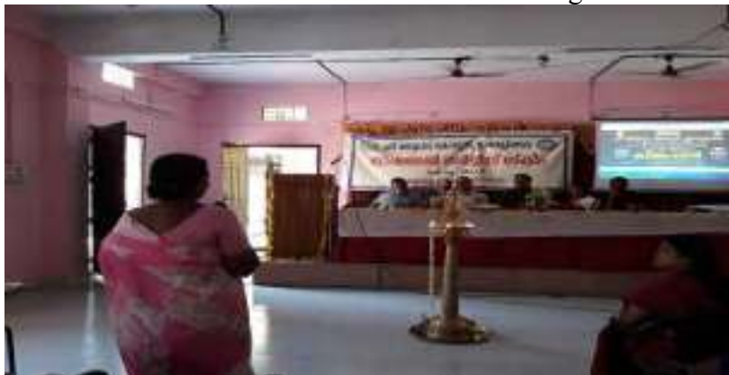
Women clearing their doubts regarding drug-abuse