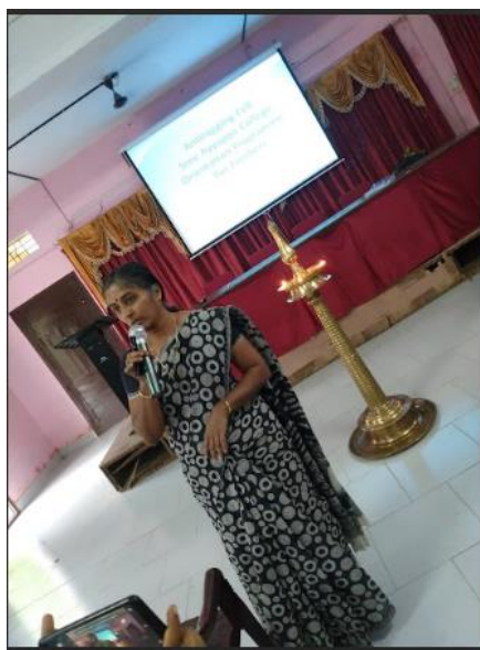
Photos of first year student's orientation programme